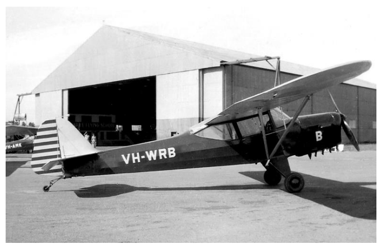
Figure 9 - J/1 Autocrat VH-WRB in Bankstown in 1956 - 3 years after Bill sold it

The Society's flying headquarters remained at Ceduna, from where it continued to operate with Alan Chadwick still as chief pilot with the DH84 Dragon and the Proctor until both were sold in 1957 to purchase the much larger (and faster) Lockheed 12A VH-BHH.